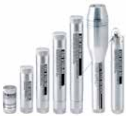
TRANSMITTERS Pg. 8-3 to 8-5