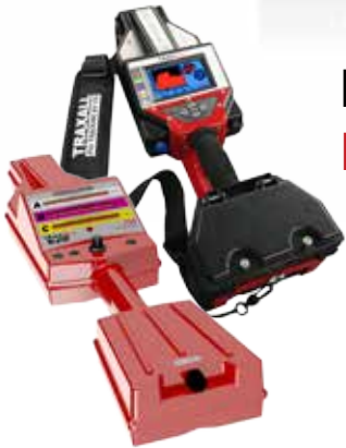
RECEIVERS Pg. 8-2