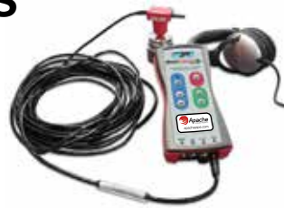
SoniTrack XLR Pg. 8-8