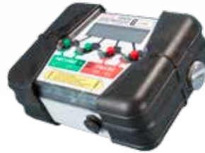
ABOVE GROUND MARKER Pg. 8-7