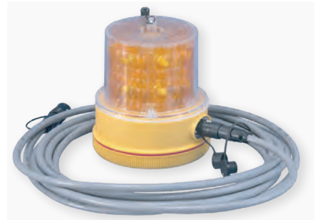
OPTIONAL REMOTE FLASHER (TRAXALL 501)