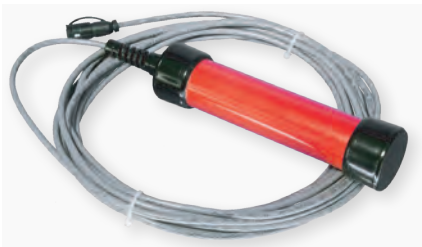
OPTIONAL REMOTE ANTENNA (TRAXALL 501)