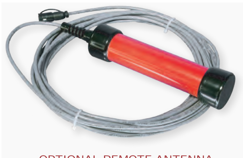
OPTIONAL REMOTE ANTENNA