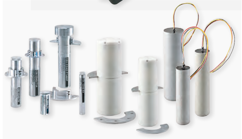
SUPPORTS CDI X-SERIES, CD42 "LEGACY," AND MANY OTHER PIGGING TRANSMITTERS