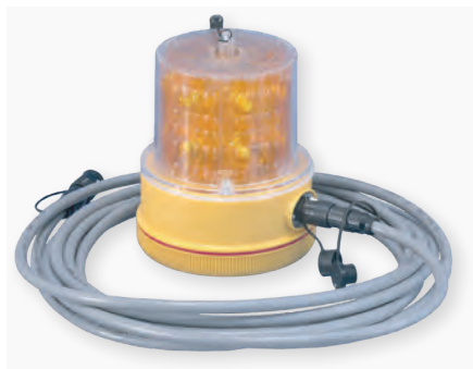
OPTIONAL REMOTE FLASHER