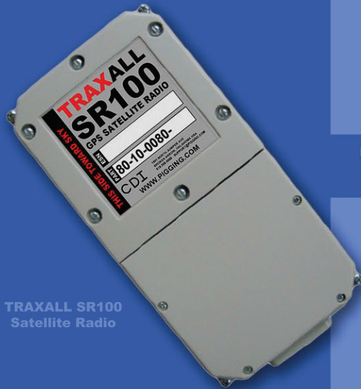
TRAXALL SR100 Satellite Radio