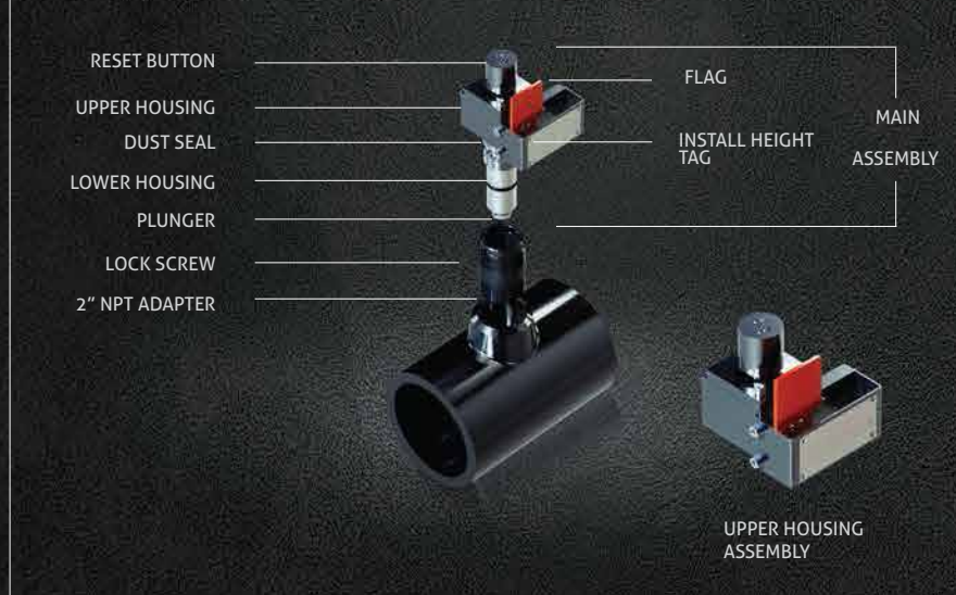
FIGURE 1 FIGURE 2 FIGURE 3 FIGURE 4