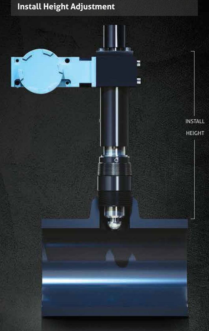
IMPORTANT : Detection of pig's passage is dependent on proper INSTALL HEIGHT. Incorrect INSTALL HEIGHT could void the warranty.

Note: See illustration for detailed drawing.